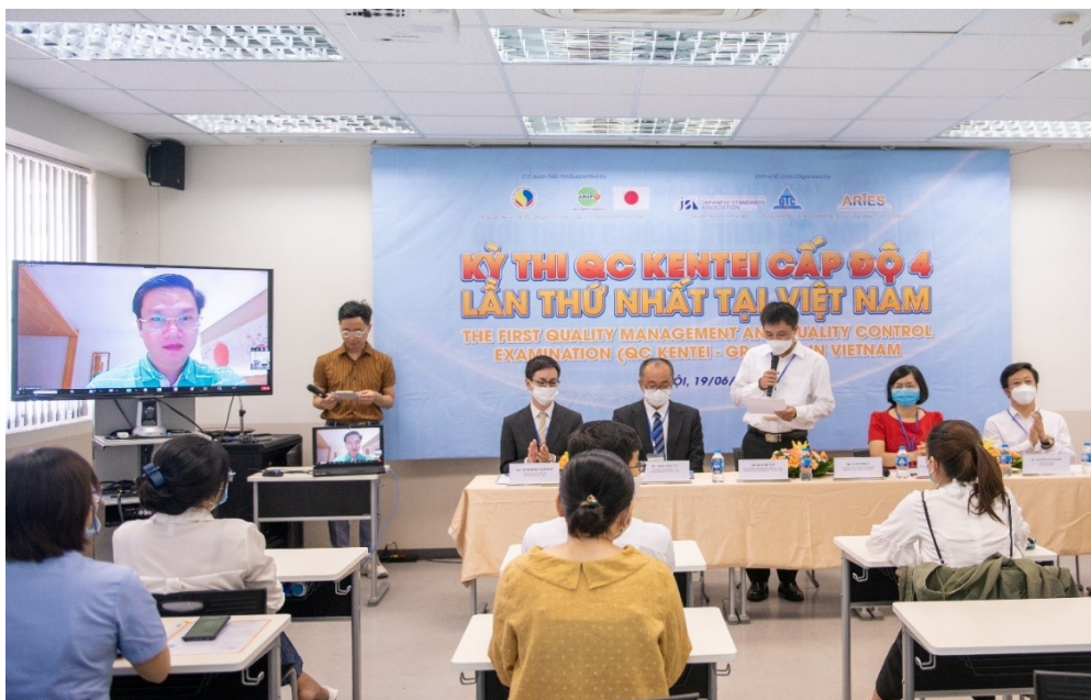
Scene of the Opening Ceremony