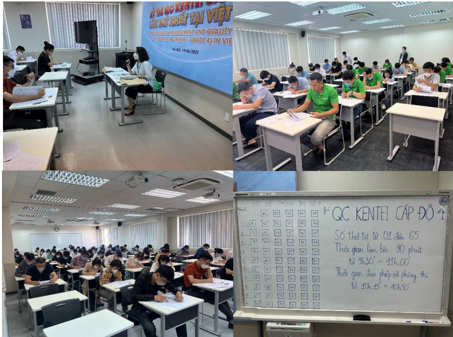
On the day of the pilot test